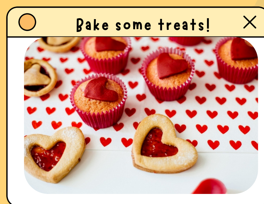
*Parent/mentor supervision recommended.