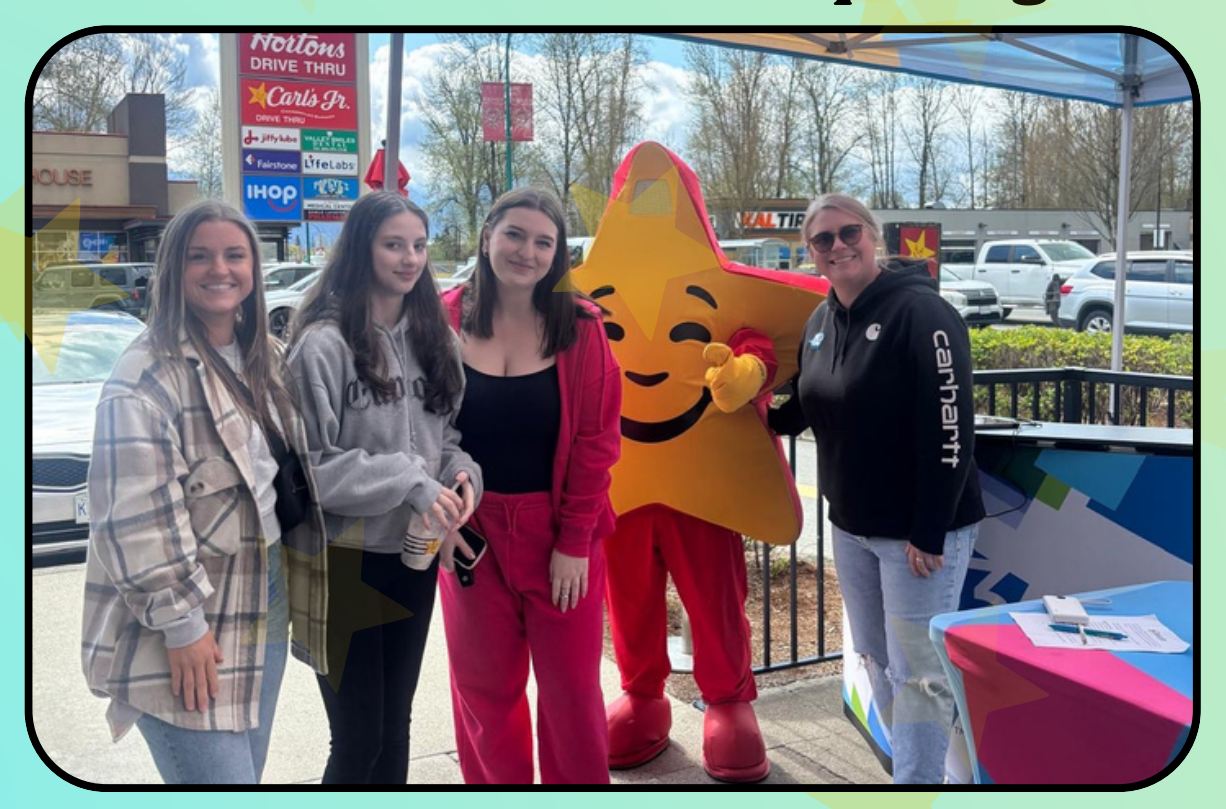
Carl's Jr. in Chilliwack is under new ownership!

We're grateful to have had the chance to spread the word of our mission and recruit mentors at their grand opening ceremony in April. Our lovely staff were joined by a few mentors who dropped by the restaurant and got a chance to speak on behalf of BBBSFV live on-air at 98.3 STAR FM!