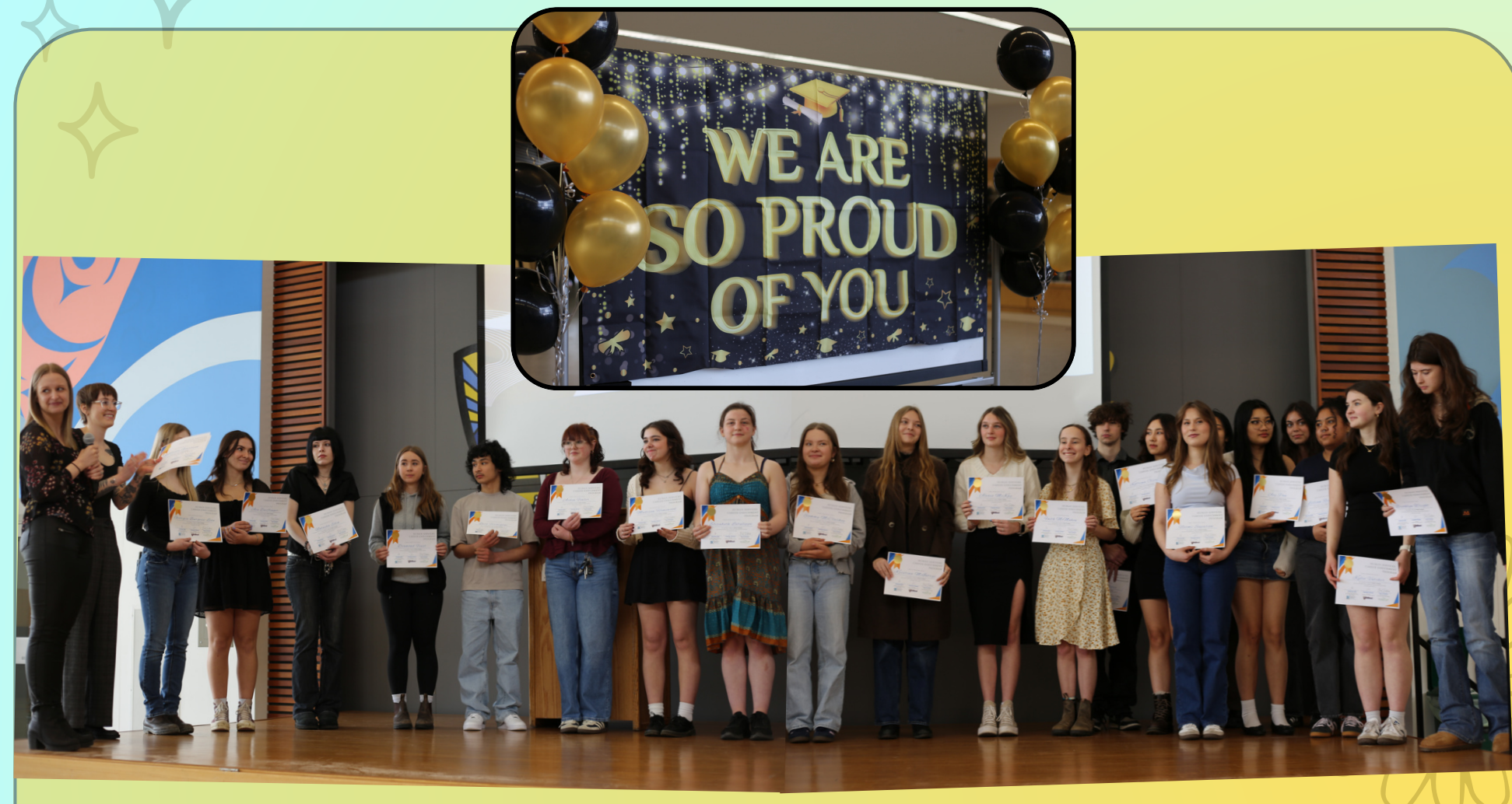
Human Services Career Enrichment Program (HSCeP) Graduation Recap from April